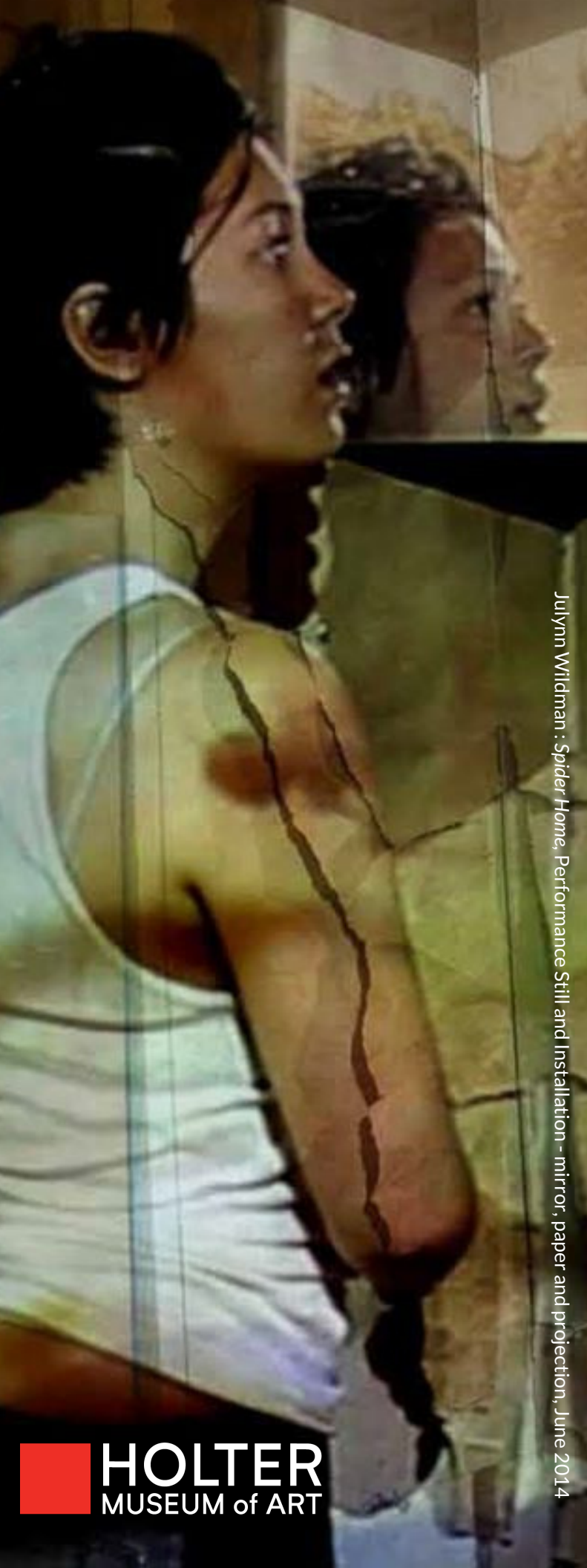
Julynn Wildman : Spider Home, Performance Still and Installation - mirror, paper and projection, June 2014